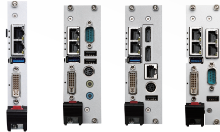
cPCI-3511(BL) cPCI-3511(BL)D cPCI-3511(BL)G cPCI-3511L